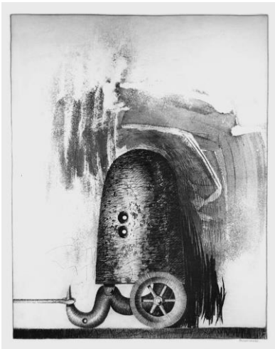
Chariot , May 1974 Watercolor and charcoal on paper 29 x 23 in. (73.5 x 58.5 cm) Private Collection © Bonevardi Estate