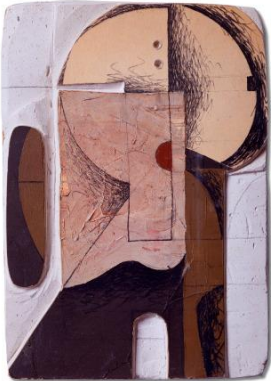
Figure with Landscape , 1967 Paint and charcoal on carved gypsum wallboard 12 ½ x 9 inches Private Collection © Bonevardi Estate

Press Images below: (Higher resolution images for publication available by request)